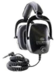
Prostar Headphones Page 29