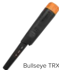
Bullseye TRX Page 19