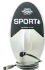
Sport 6x10 Coil Page 30