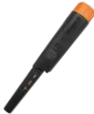
Bullseye TRX Page 19