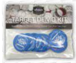
Target Demo Kit Page 29