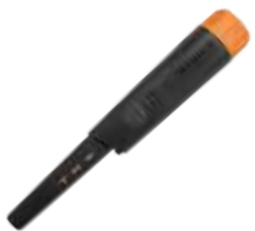
Bullseye TRX Pinpointer Page 19