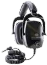
ProStar Headphone Page 29