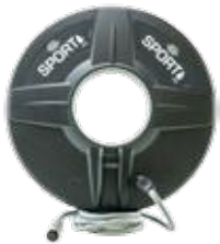
Sport 950 Coil Page 30