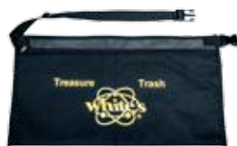
Deluxe Apron Page 29