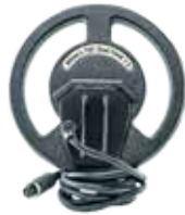
TDI 7.5" Dual Field Available on our website