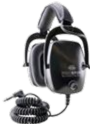
ProStar Headphone Page 29