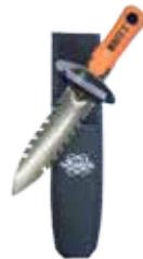
DIGmaster Page 29