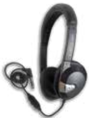
Starlight Headphone Page 29