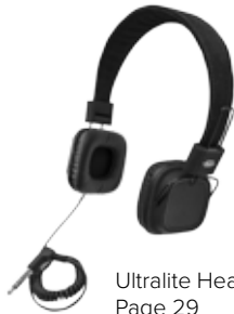
Ultralite Headphone Page 29