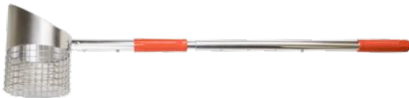
Long Handled Sand Scoop Page 30