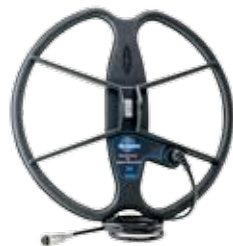
Detech Coil Available on our website