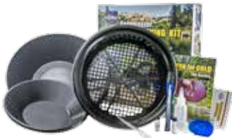
Deluxe Gold Pan Kit Page 30