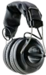
Wireless Headphone Page 29