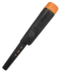
Bullseye TRX Page 19