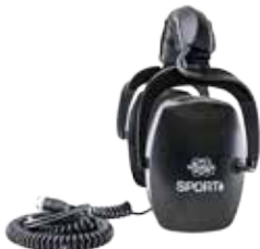
Sport Headphones Page 29