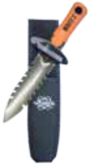
DIGmaster Page 29