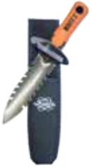
DIGmaster Page 29