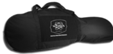
Classic Carryall Bag Page 29