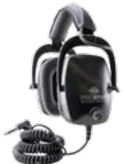
ProStar Headphone Page 29